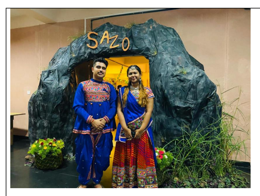
Figure 1 RECEIVING THE GUESTS